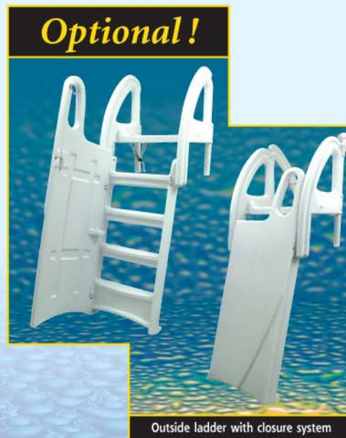
Outside ladder with closure system